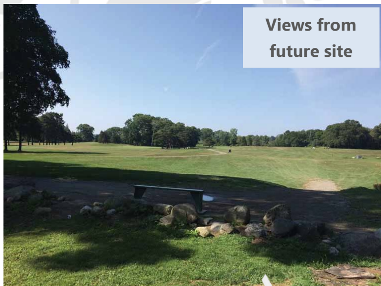
Views from future site