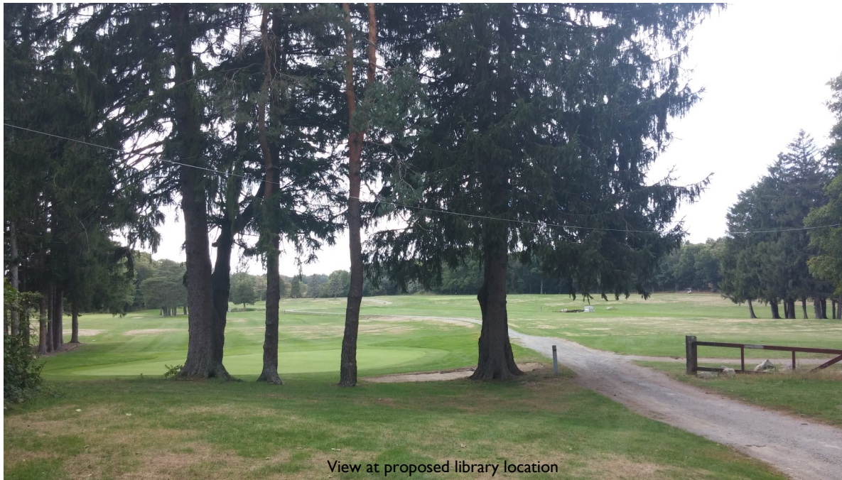
View at proposed library location